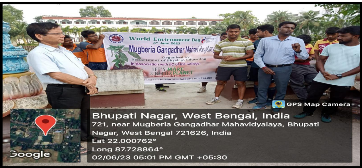
After plantation the Discussion is going on regarding plantation with the presence of our Principal Sir