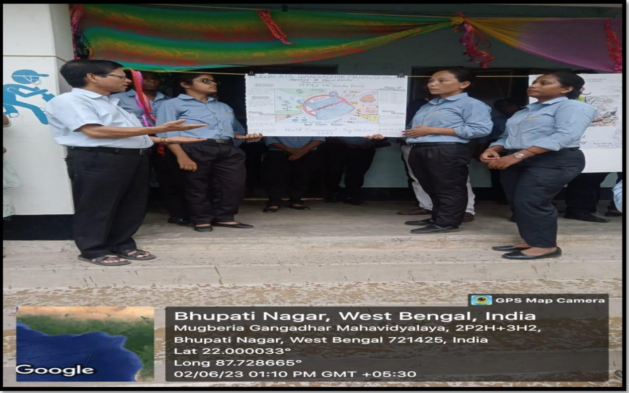
During poster presentation